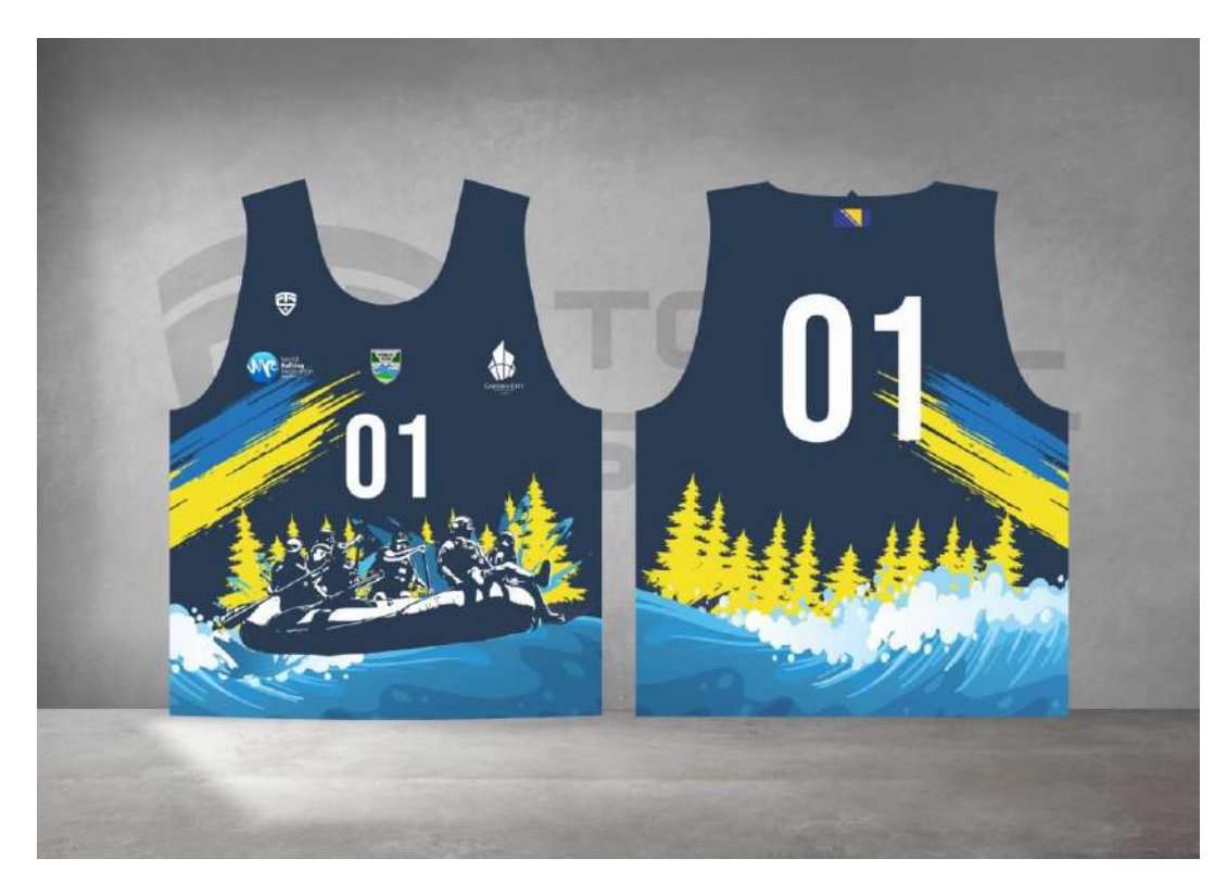
Official vest for the downhill and slalom races.

Important : National flags, other flags, propaganda, or messages are not allowed on the podium.