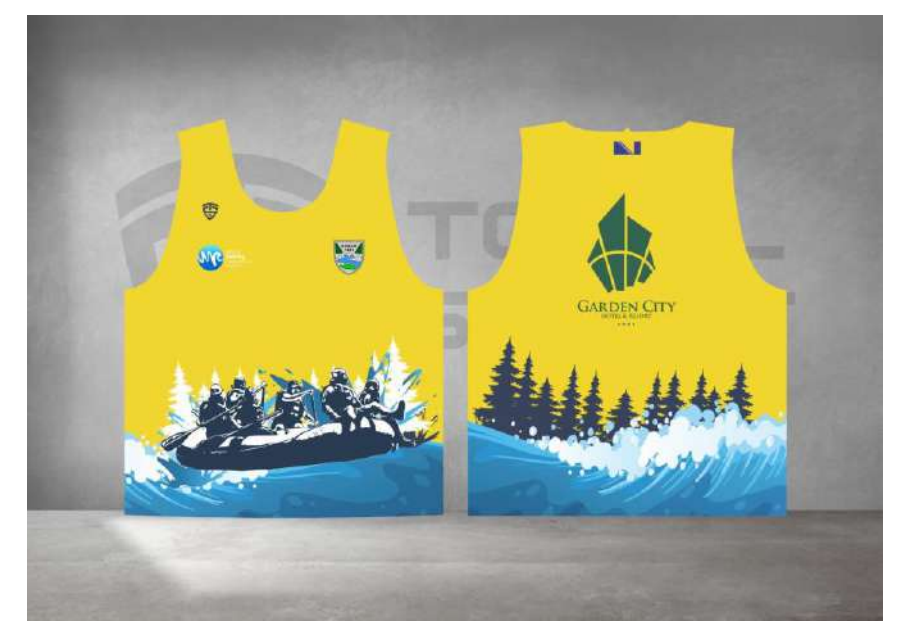
Official marker for the RX race - yellow.